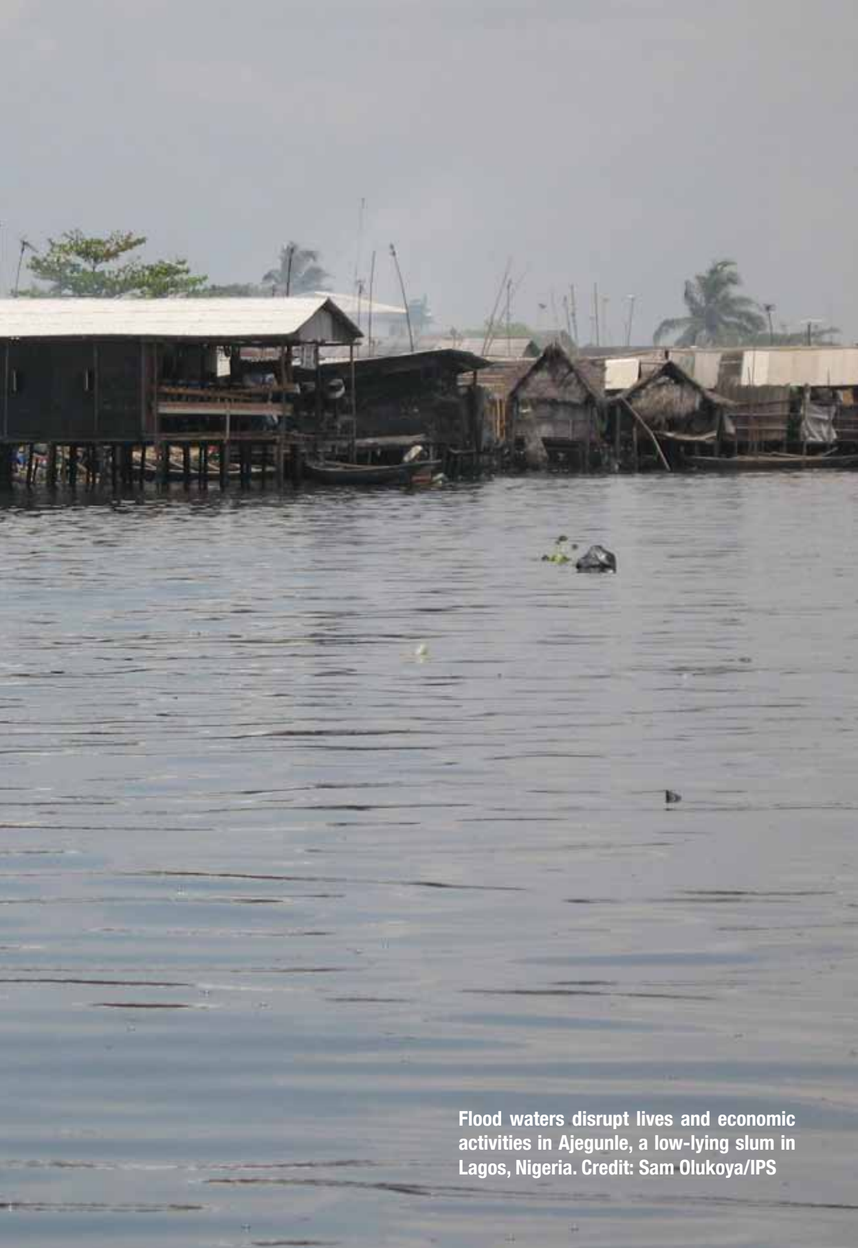
Flood waters disrupt lives and economic activities in Ajegunle, a low-lying slum in Lagos, Nigeria.