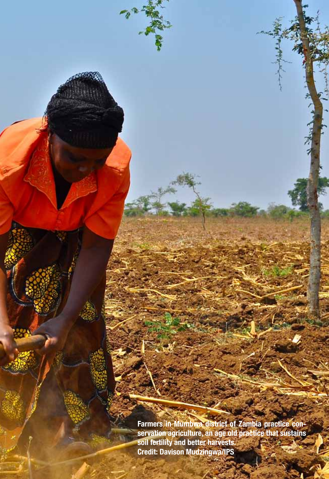
Farmers in Mumbwa district of Zambia practice conservation agriculture, an age old practice that sustains soil fertility and better harvests.