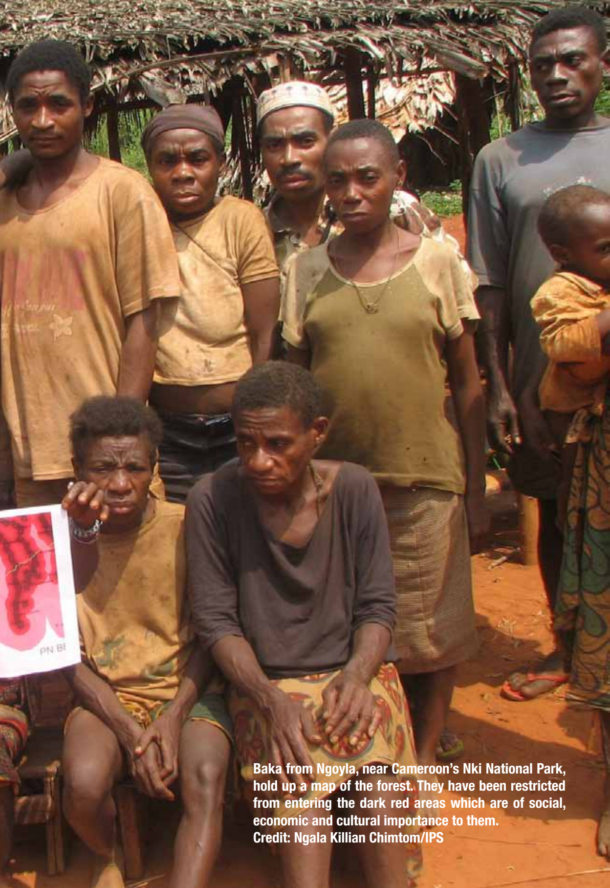
Baka from Ngoyla, near Cameroon's Nki National Park, hold up a map of the forest. They have been restricted from entering the dark red areas which are of social, economic and cultural importance to them.