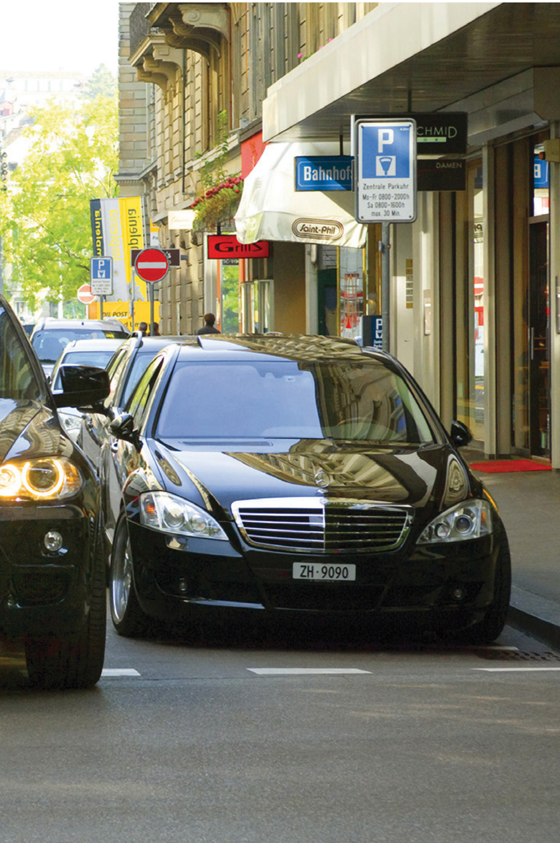
Even I exist in Embo: jaundiced tales of counterpenetration #2, 2007.

verse irony that must be understood when analysing Kenya's foreign policy stance.