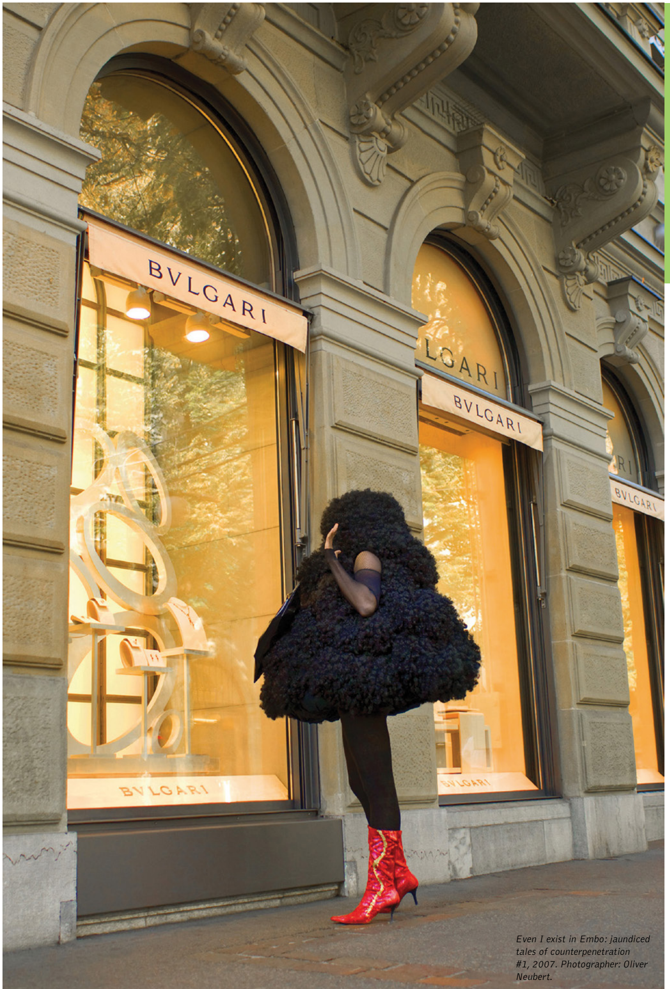
Even I exist in Embo: jaundiced tales of counterpenetration #1, 2007.