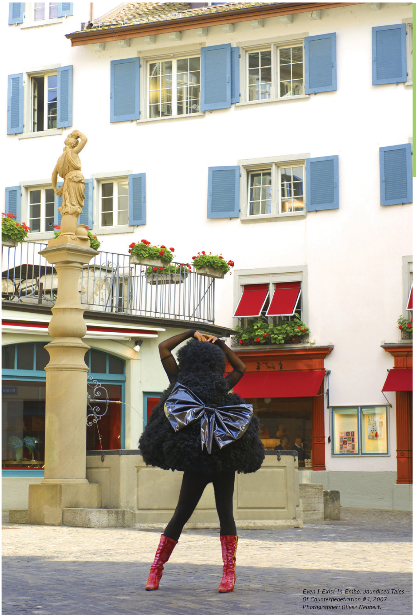
Even I Exist In Embo: Jaundiced Tales Of Counterpenetration #4, 2007.