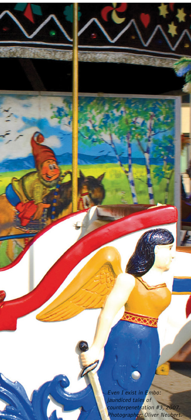
Even I exist in Embo: jaundiced tales of counterpenetration #3, 2007.

The second face of perceptions is evident in the realm of African civil society, which is composed of social movements, grassroots organisations and other non-state actors that have taken up the struggle for social justice and human rights. This sector is pre-occupied with the threats they associate with the emerging powers. Here, the same accusations of exploitation, underdevelopment and marginalisation that were levelled against former colonial powers are now directed to the rising powers’ engagement across the continent. This perception is rein-