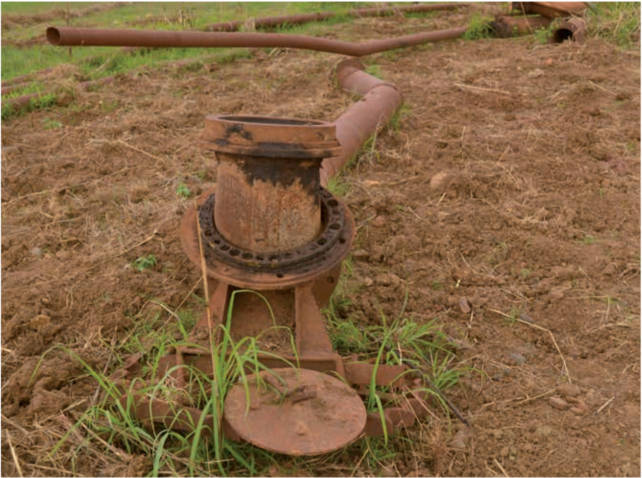
Abandoned mining equipment.