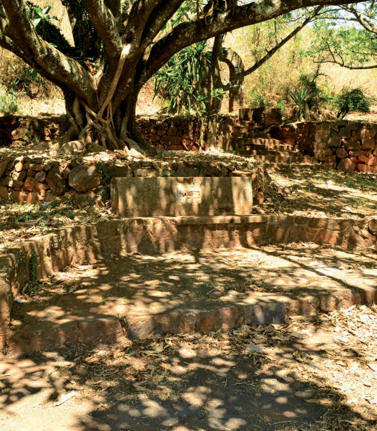
Location where the Great Indaba Tree used to be.