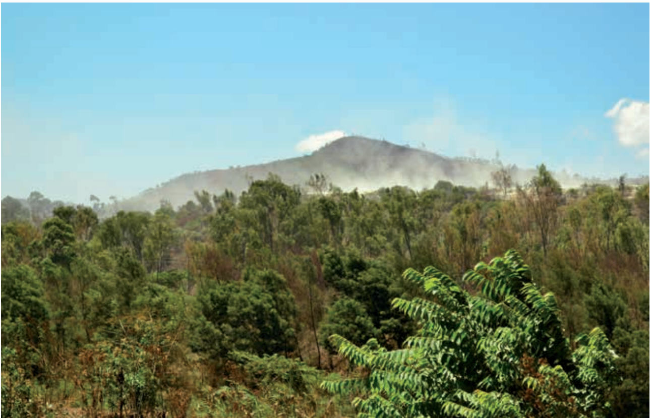
Top: Hazardous ponds created by DTZ-Ozgeo and left open. Bottom: Dust rising from the King's Daughter / Redwing slime dam.