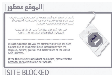
“Site Blocked”

Faced with these legal, social, political and economic constraints, how can journalists and bloggers responsibly cover sensitive issues around religious, sexual and gender minorities while staying out of hot water?