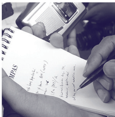
"Journalists on Duty"

Journalists should strive to determine whether speech is deliberately designed to denigrate the rights of others and should know what forms of expression are subject to legal sanctions. When confronted with incidents of hate speech, EJN advises journalists not to sensationalize the story and to pause for a moment before publishing to think through potential consequences.