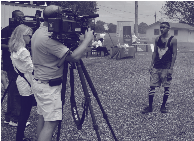
“LGBT Diversity Color Run”

A story should be newsworthy and useful to your audience. While some media aim to entertain, it is unfair to trivialize the lives and stories of minority groups to entertain the majority.