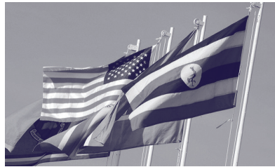
U.S. and Uganda flag.