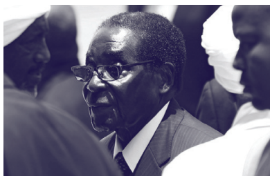
President of Zimbabwe Robert Mugabe on 2 June 2015.