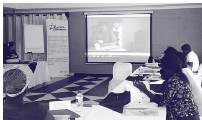
The nonprofit Tuliam held a dialogue workshop with female church leaders in Otjiwarongo, Namibia, on 6 August 2016.