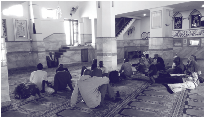
Trainees visit Auwal Masjid in Bo-Kaap, Cape Town.

The following reporting resolution, drafted as a group exercise at the end of the Cape Town training, reflects some of the best practices journalists identified to improve coverage of sexual and gender minorities & religion. It serves as a useful starting point and summary of what's to come in this reporting guide.