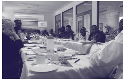
Trainees hear from Imam Muhsin Hendricks.

This guide summarizes the key topics discussed at the Cape Town workshop and provides readers a trove of resources and sources to enhance their own coverage of these issues. It also includes final versions of trainees' stories, which originated during the workshop and evolved in the weeks that followed under Religion News Foundation's editorial guidance and support. To read more of the trainees' stories, visit: http://religionnews.com/tag/lgbtqi-religion-africa/ .