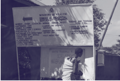
Bwala Referral Hospital in Lilongwe, Malawi.